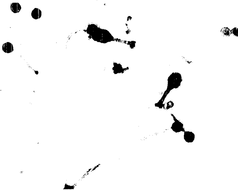
Fig. 1. Electron micrograph of the DNA containing MS2-like phages mixed with T4 phage. Uranyl acetate (2%) staining. X 120000

MS2 phage (Fig. 2) that the derivative particles are markedly larger comparing to the MS2 ones. Their icosahedral head having a diameter about 50 nm, and their tails being about 150—160 nm long. Despite of these particles strict specificity for donor type cells, our electron microscopic investigations detect no derivative particles adsorption on F-pili. The cause of this phenomenon is supposed to be elucidated in further investigations. At the same time such particles form negative colonies belonging to the same type as the colonies formed by P1 and lambda transducing phages segregants [5]. Despite of the bacterial lawn ageing, the colonies of DNA-containing MS2 derivative phages become larger during several days, the demi-lysis zones becoming also wider and occupying the whole lawn. The cells containing the recombinant plasmid pL34 constructed by us [3] also accumulate the DNA-containing phage identical to those one found in MS2-induced mutants from the point of view of its morphology, its neutralization with anti-MS2 serum, and its restriction obtained after restriction nucleases treatment (see Fig. 3). The identical DNA-containing particles are also found in MS2 preparations, such an identity having been proved by the markers already described above for other DNA-containing phages neutralizing with anti-MS2-serum.