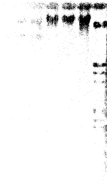
Fig. 3. Electrophoregram of the DNAs isolated from MS2-like phages and digested with restrictases HaeIII (1-3), PstI (4-6), and BamHI (7-9) (1, 4, 7 - DNA of the phage segregated from E. coli 3000 lysing type mutant; 2, 5, 8 - DNA of the phage segregated from E. coli granular mutant; 3, 6, 9 - DNA from the phage segregated from pL34 containing cells); 10 - lambda phage DNA + EcoRI + HindIII (marker lane)

The formation of DNA-containing phages in MS2-induced E. coli mutants suggests once more that some processes well known and investigated in detail may be accompanied with some other events of a very low frequency followed by new biological forms birth being new virus forms in our case. Contrary to retrovirus-cell systems, no DNA-containing structures taking part in RNA-containing phages reproduction and phage RNA replication have been yet described. Additionally, the construction of revertase-target MS2 DNA in vitro is completely impossible without artificial connection of the poly(dA)·poly(dT)-linker to MS2 phage RNA [10] being inaccessible for this enzyme without such a supplement. So it cannot be ruled out that the process of formation of DNA-containing phages antigenically related or identical to RNA-containing ones may be due to other mechanisms of RNA-DNA interactions perhaps more similar to those described previously for prokaryotic cells [11]. It cannot be ruled out that the presence in the bacterial cell of RNA-phage specific information independently of its form (phage multiplication or some other form specific for MS2-induced cell mutants) induces prophages presented in E. coli cells chromosomes and plasmids. Such a prophage sequence may form hybrid forms with RNA phages components both on the level of genomes and MS2-specific protein coating of phage particles with new properties.